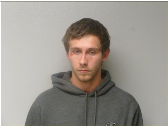
Refer To Arrest: 18-474-AR